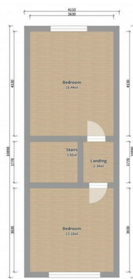
Sellywood First Floor