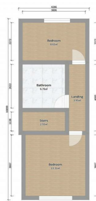
Sellywood Second Floor