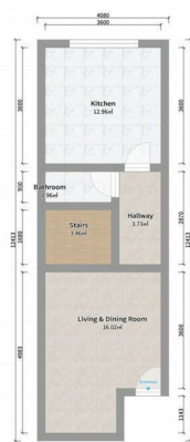
Sellywood Ground Floor